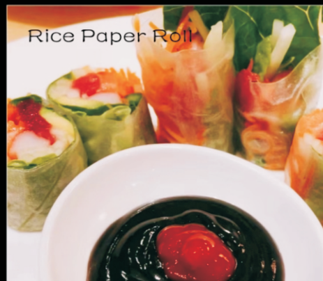
Rice Paper Roll