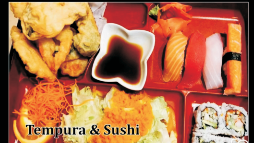
Tempura & Sushi