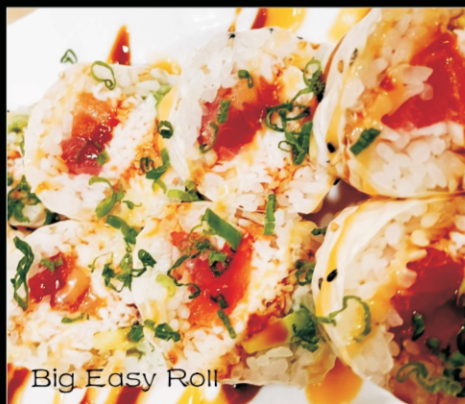
Big Easy Roll