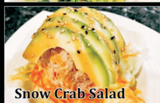
Snow Crab Salad