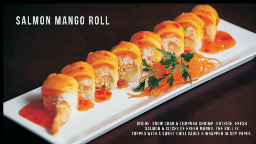
SALMON MANGO ROLL

INSIDE: SNOW CRAB & TEMPURA SHRIMP. OUTSIDE: FRESH SALMON & SLICES OF FRESH MANGO. THE ROLL IS TOPPED WITH A SWEET CHILI SAUCE & WRAPPED IN SOY PAPER.