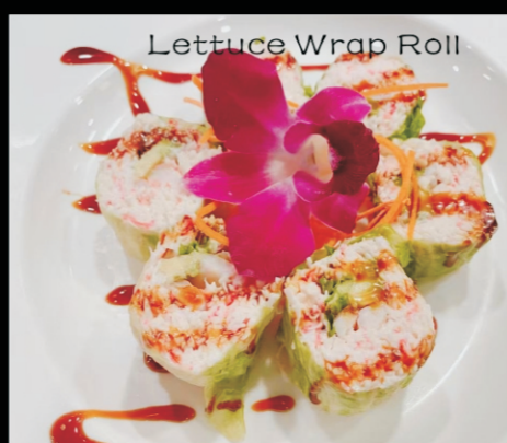
Lettuce Wrap Roll