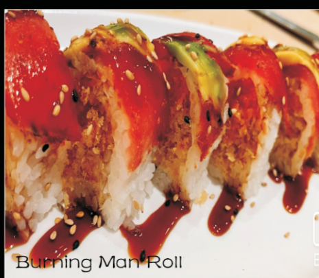
Burning Man Roll