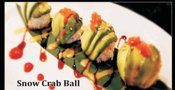
Snow Crab Ball