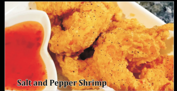
Salt and Pepper Shrimp