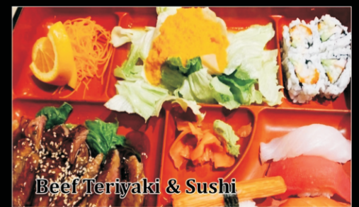
Beef Teriyaki & Sushi