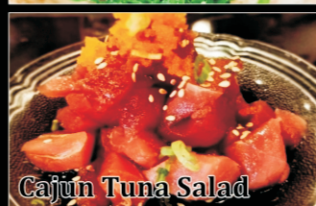
Cajun Tuna Salad