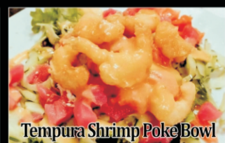
Tempura Shrimp Poke Bowl