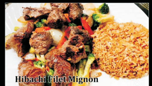
Hibachi Filet Mignon