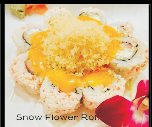
Snow Flower Roll