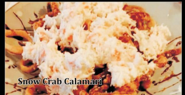
Snow Crab Calamari