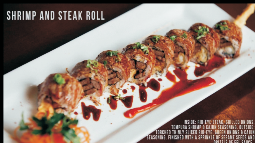
SHRIMP AND STEAK ROLL

INSIDE: SNOW CRAB & TEMPURA SHRIMP. OUTSIDE: FRESH SALMON & SLICES OF FRESH MANGO. THE ROLL IS TOPPED WITH A SWEET CHILI SAUCE & WRAPPED IN SOY PAPER.