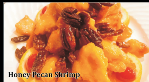
Honey Pecan Shrimp