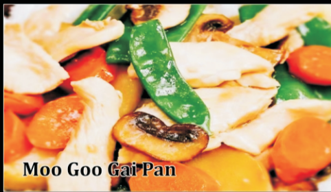
Moo Goo Gai Pan