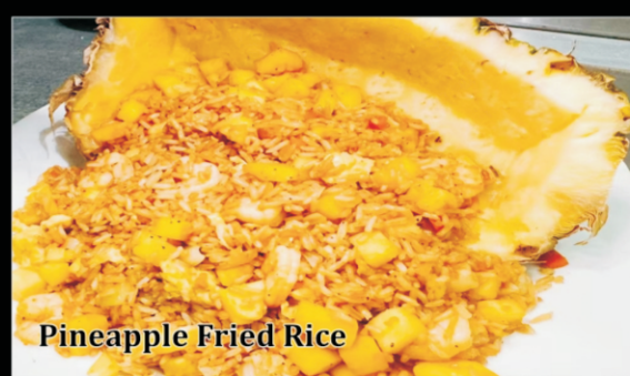
Pineapple Fried Rice