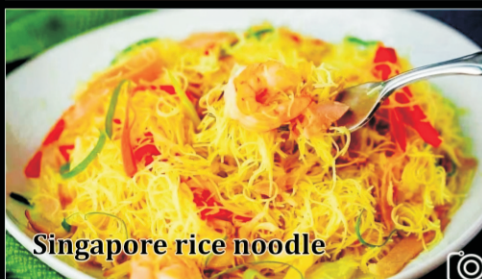
Singapore rice noodle