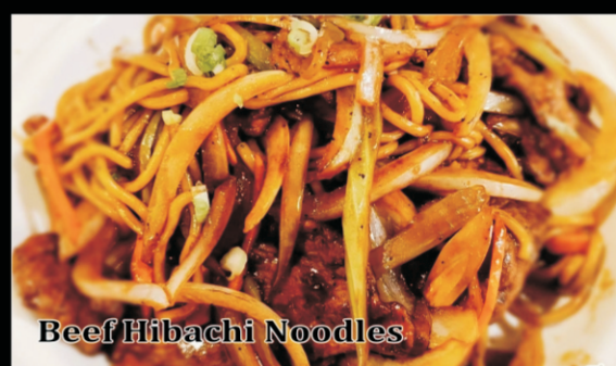
Beef Hibachi Noodles

With beef, chicken, or shrimp. Add $1.00 for combination