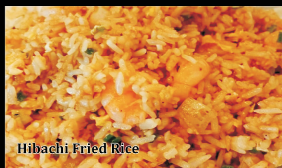
Hibachi Fried Rice