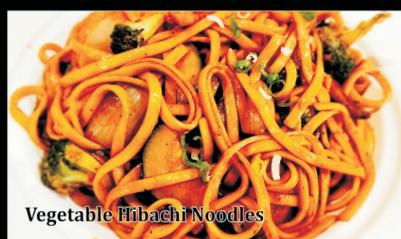
Vegetable Hibachi Noodles

Choice of beef, chicken, shrimp or vegetables, add $1.00 for combination