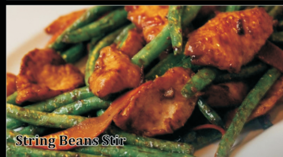
String Beans Stir